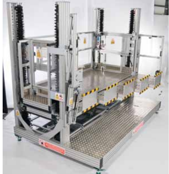
Rexroth Vertical Personnel Platform Bosch Group