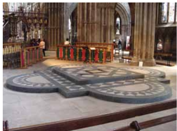
LICHFIELD Raising Floor Cathedral +

see our website for further information on these applications