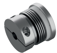
Fig. model iBKH