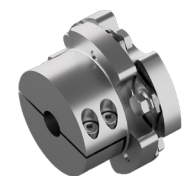
Fig. model iLPH