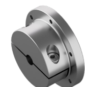
Fig. model iSNH