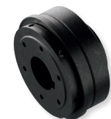
Fig. model iSKP